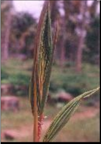
Fig. 1. Fasciation of leaves