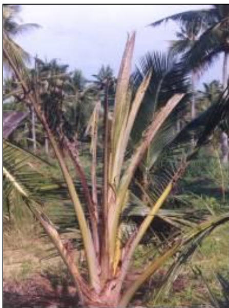
Fig. 7. Boron deficient Palm