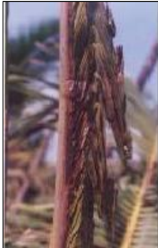
Fig. 2. Hooking of leaves