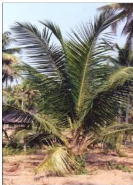
Fig. 8. Same palm after 18 months of boron application