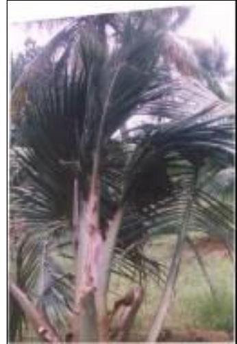
Fig. 3. Reduction of leaf size