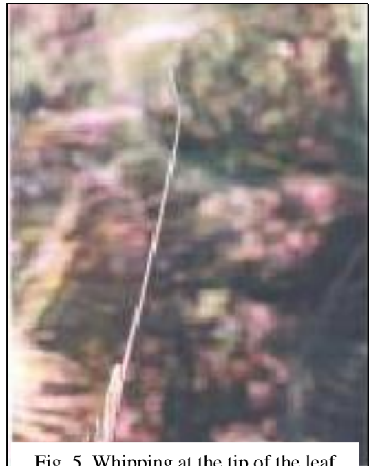
Fig. 5. Whipping at the tip of the leaf