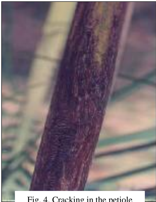
Fig. 4. Cracking in the petiole