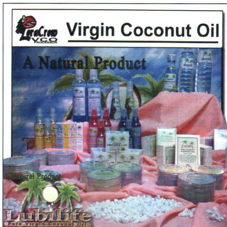
The various "Lubilife" products

The products are marketed through direct selling through pharmacy outlets, health shops, malls, and department stores and multi-level marketing by a pool of satisfied consumers who impart the product knowledge to others in order share the benefits to many.