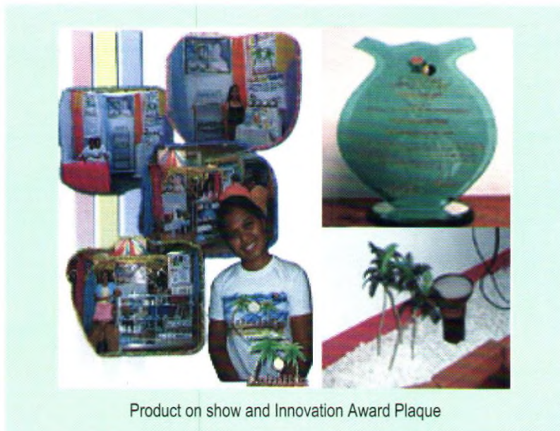
Product on show and Innovation Award Plaque

from coconut water and the latest product being developed is the high fiber coconut cereals from the coconut kernel which contains high dietary fibers as studied by the Food and Nutrition Research Institute (FNRI) and hence beneficial to human health.