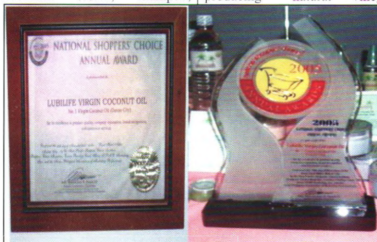
Shopper's Choice Award Plaque & Certificate

body butter, body cream, body scrub, foot scrub, massage oils, mosquito spray, and soaps of different variants using naturally extracted essential oils. The company is also producing natural vinegar